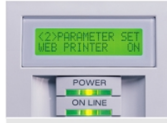
▲ User-friendly display